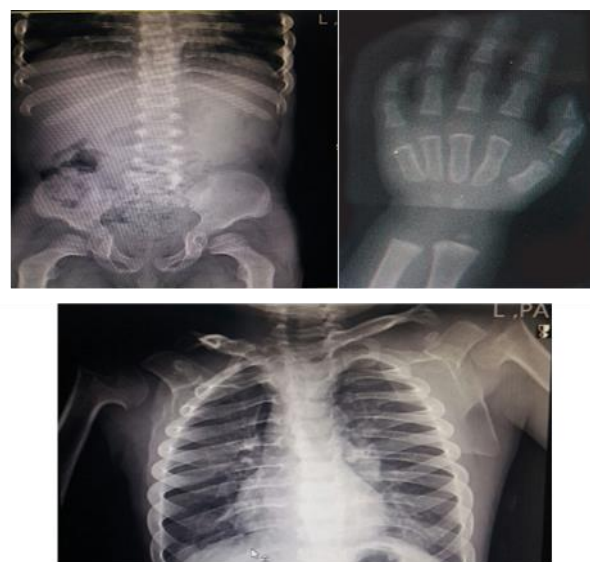
Figure 3. Hand, waist, pelvis and chest radiographs

the narrowing of the proximal part of the ribs was evident and the humeral head slipped inferiorly out of the glenoid fossa (Fig 3). In electromyography of upper extremity, abnormal median nerve conduction in both wrists represented carpal tunnel syndrome. The patient was normal in terms of vision, and there was a slight bilateral hearing loss in the examination of the ears.