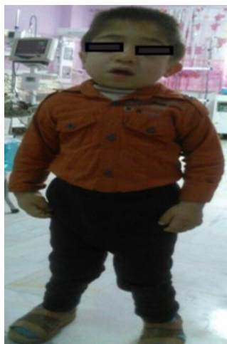
Figure 1. Physical appearance of the child with MPS VI

abnormal inclusions were observed in neutrophil cytosol by the pathologist (Fig 2). Paraclinical follow-up was performed to further investigate the complications of the disease. Heart failure, tachycardia, mitral valve prolapse and pulmonary valve failure were observed in patient's echocardiography.