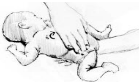
Figure 1. Yakson therapeutic touch (22)

In this study, we used the Anderson Behavioral State Scale (ABSS) to determine the effects of Yakson therapy on the behavioral response of premature infants (23). Validity of this tool has been reviewed previously by a panel of experts (24), and reliability of the measure was assessed through meticulous observations (25-27). ABSS was translated from English to Persian by two experts, and two other experts translated the scale back into English, which yielded satisfactory results. Since this measure is used for the evaluation of physiological parameters, content validity was not required. In ABSS scoring system behavioral status of the infant is assessed based on status of the trunk and level of activity, (open or closed) eyes, and severity of crying, limbs classifying behavioral status into three levels. Status of waking, sleeping, and restlessness phases, sleep and waking is scored and (most appropriate nursing mode) respectively behavioral. In this study, restlessness is scored. Response of the premature infants was measured. Data minutes before and after the intervention, test-analysis was performed using independent t and Chi-square test in SPSS. V-square and paired t-Test was considered significant ( p < 0.05 ).