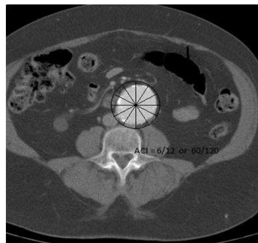
Figure 1. Dividing the transverse section of the abdominal aorta into 12 sectors. In this image calcification is seen in 6 sectors

People with acute infection, known malignancy, active collagen vascular disease such as rheumatoid arthritis, and taking phosphate binder, such as renagel or aluminum hydroxide, during the test (in cases used these drugs, drugs must be discontinued at least one month before entering the study), dialysis period less than 3 months, diabetes, being treated with anticoagulants and having a history of parathyroidectomy or parathyroid dysfunction were excluded. Hemodialysis patients underwent axial CT scan without contrast on abdominal aorta. TACI was measured according to 10 sections of the abdominal aorta from the origin of renal arteries from the aorta to the abdominal aortic bifurcation. Each section of the aorta was divided into 12 sections. (Fig 1).