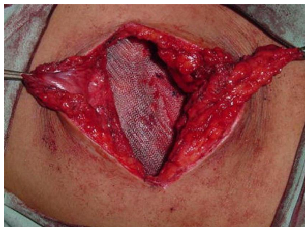
Figure 1. Illustrating the attachment of the wide pore lightweight polypropylene mesh to the anterior rectus sheath

Group A consisted of 26 patients who underwent mesh repair using wide pore polypropylene. The lightweight polypropylene mesh was secured to the anterior rectus sheath using interrupted non-absorbable polypropylene sutures that passed over the muscle of rectus. Prior to this, the layers on the right side of rectus sheath were sutured from both sides by sewing thread (Figure 1). The mesh extended 4-5 cm on each side, and the Onlay technique was employed for mesh repair in all patients. The skin was closed through a subcutaneous 18 Fr suction drain.