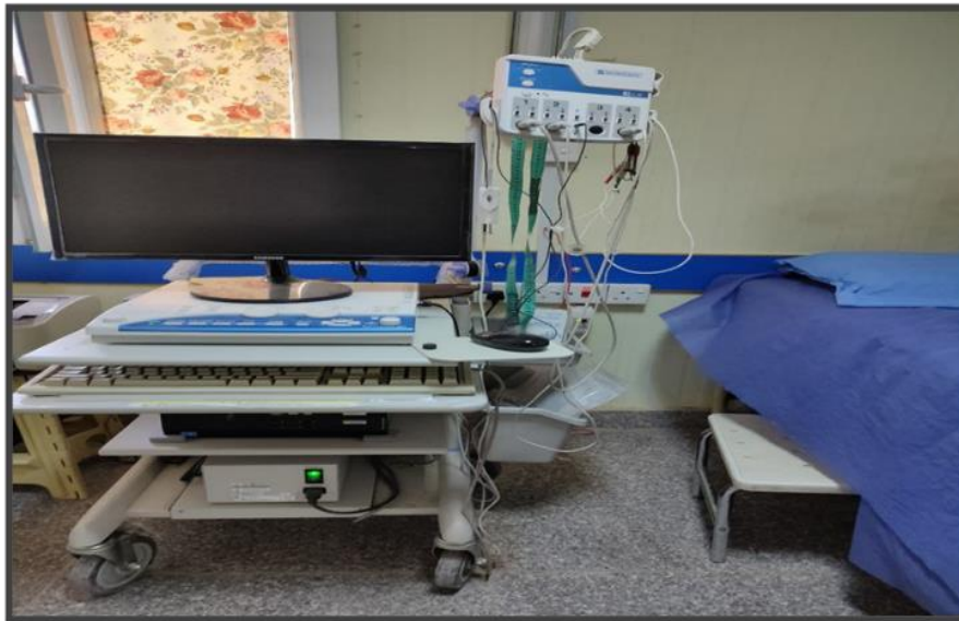
Figure 1. Nihon Kohden Nerve conduction study machine

The results of the study were imported to a computer program, Statistical package for Social Science (SPSS 20 for windows; SPSS Inc.). The obtained data were analyzed by several tests according to their type. T-test was used to compare between numeric variables, ROC curve is utilized to enhance the sensitivity and specificity of the analysis (9). P-wave less than 0.5 was considered as significant findings.