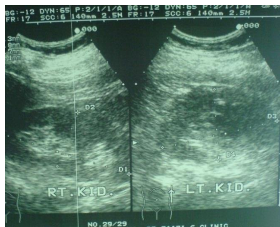
Figure 1. Ultrasonography showed 7×8 cm heterogenic solid mass with clear wall and central necrosis at middle- lower pole of right kidney.

Albendazole 200 mg twice a day was started for 6 months with monthly full blood tests and liver tests. During the follow-up period of the patient, abdominal ultrasound, chest x-ray and laboratory tests of kidney, liver and IHA were performed and during the 1-year follow-up period of the patient, no evidence of recurrence or new infection was observed.