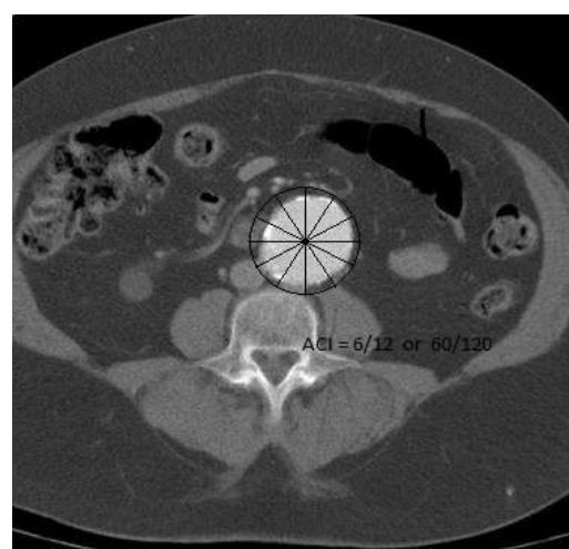
Figure 1. Dividing the transverse section of the abdominal aorta into 12 sectors. In this image calcification is seen in 6 sectors

People with acute infection, known malignancy, active collagen vascular disease such as rheumatoid arthritis, and taking phosphate binder, such as renagel or aluminum hydroxide, during the test (in cases used these drugs, drugs must be discontinued at least one month before entering the study), dialysis period less than 3 months, diabetes, being treated with anticoagulants and having a history of parathyroidectomy or parathyroid dysfunction were excluded. Hemodialysis patients underwent axial CT scan without contrast on abdominal aorta. TACI was measured according to 10 sections of the abdominal aorta from the origin of renal arteries from the aorta to the abdominal aortic bifurcation. Each section of the aorta was divided into 12 sections. (Fig 1).