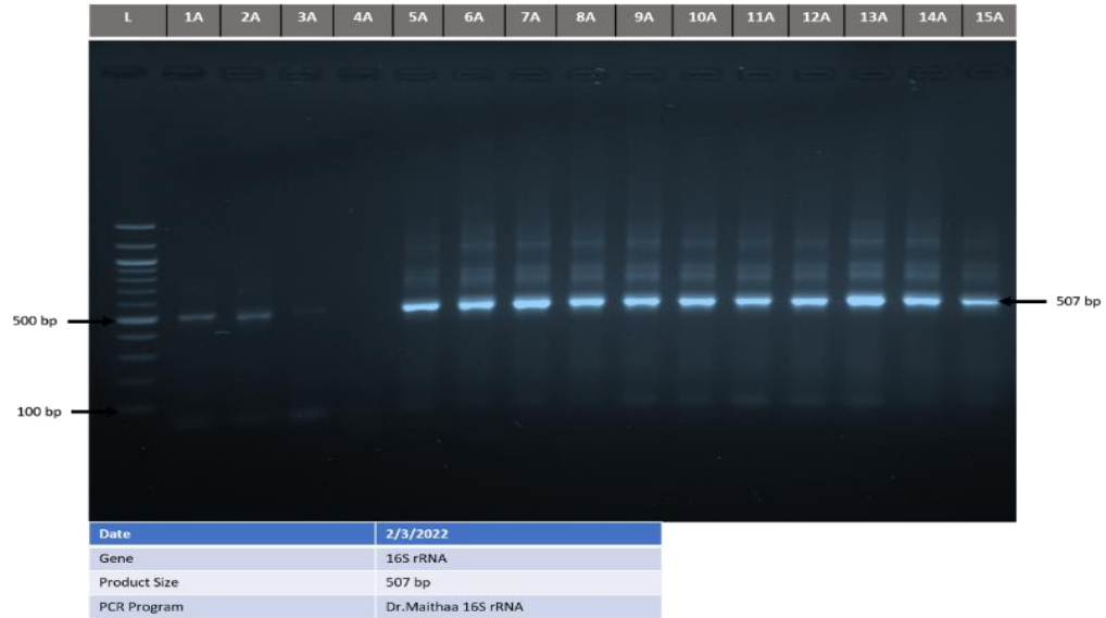
Figure 1. Electrophoresis of 16srRNA for caries free children