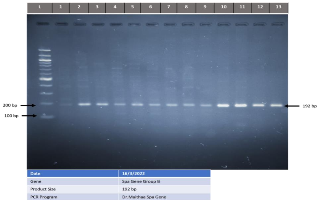
Figure 4. Electrophoresis of spaP gene for children with severe caries