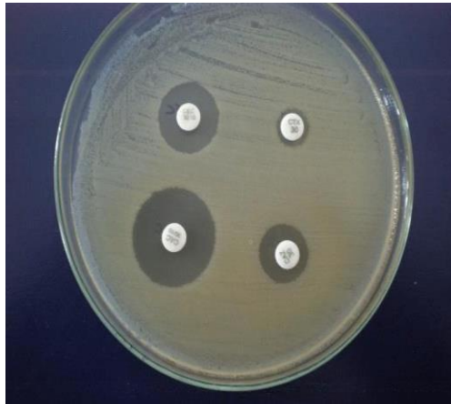
Figure 2. Inhibition zone in nystatin and ginger disks