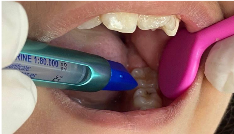
Figure 2. Injection with NumBee in the lingual sulcus of mandibular left permanent first molar

The children's feelings were demonstrated as faces from a smile expression to a crying expression that are described vocally as ("No Hurt" to "Hurts Worst") and the child was asked to choose the face that expresses his / her feeling; the pain scale was well explained to the child prior to utilizing the scale to understand numeric ranking from "0" to "10" scales (19).