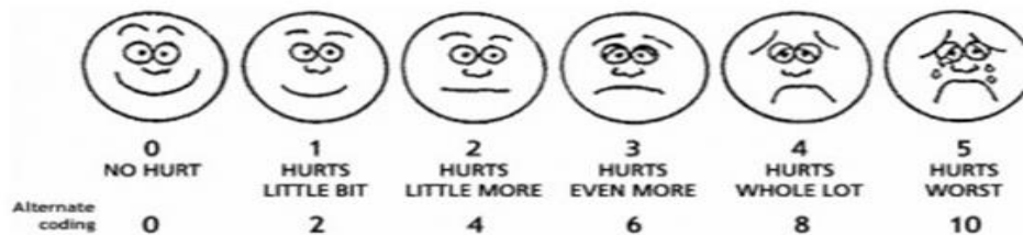
Figure 3. The Wong-Baker Face Pain Scale (20)

Successful anesthesia with NumBee can be anticipated after about 40 seconds (21), while for the IANB technique, 1.5 ml of anesthetic solution was deposited over the course of 60 seconds (22). The IANB requires a five-minute waiting period before the dentist can initiate treatment (23).