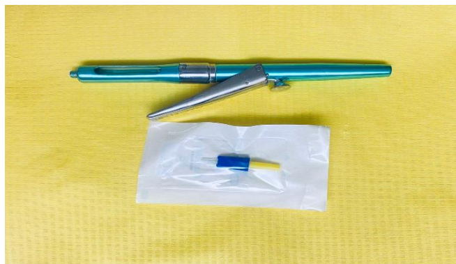
Figure 1. The NumBee (BioDent, Simi Valley, CA)

Various injection devices had been released in order to alleviate the children's pain during local anesthetic injection, which include computer-controlled local anesthetic delivery (CCLAD), vibrotactile devices, computer-assisted intraosseous anesthesia (CAIO), the Quick sleeper, and the needleless intraligamentary syringe (3). The NumBee (BioDent, Simi Valley, CA) is a unique device that delivers local anesthetic atraumatically without a hypodermic needle (12) (Figure 1). It is a tiny silicone-encased metal cannula for intraligamentary injections without periodontal ligament penetration.