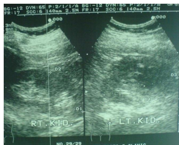
Figure 1. Ultrasonography showed 7×8 cm heterogenic solid mass with clear wall and central necrosis at middle- lower pole of right kidney.

Albendazole 200 mg twice a day was started for 6 months with monthly full blood tests and liver tests. During the follow-up period of the patient, abdominal ultrasound, chest x-ray and laboratory tests of kidney, liver and IHA were performed and during the 1-year follow-up period of the patient, no evidence of recurrence or new infection was observed.