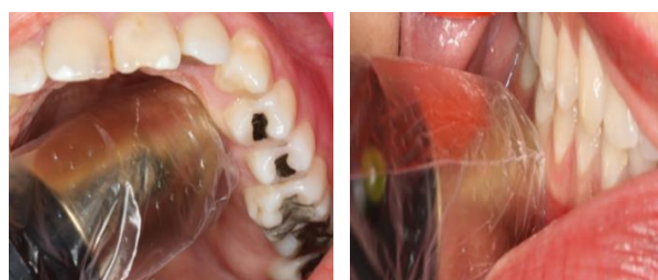
Figure 1. How to place the laser probe in the buccal apex area (right), how to place the laser probe in the lingual apex area (left)

a power of 200 mW was used, and the radiation method was spotted. The location of the laser irradiation on the root surface was beyond the bone of the buccal and lingual surfaces of the sensitive teeth. The apex of posterior teeth was laser irradiated for 3 minutes (90 seconds from the buccal and 90 seconds from the lingual) (Figure 1).