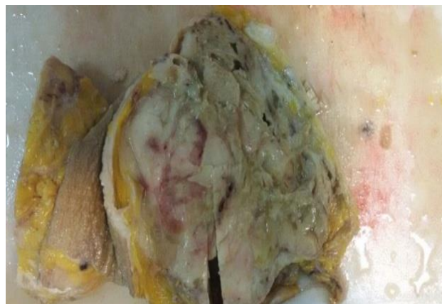
Figure 1. A surgical specimen of the breast with gray color and necrosis of areas with irregular margins that surrounded by normal fatty tissue