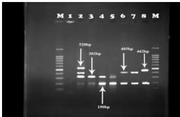
Figure 1. Results of amplification of AmpC genes. MOX gene with a length of 520 bp, CIT gene with a length of 462 bp, DHA gene with a length of 405 bp, EBC gene with a length of 302 bp, FOX gene with a length of 190 bp and ACC gene with a length of 346 bp. Well 1: negative control. Wells 2 to 8: positive samples in terms of the presence of genes. Well M: 100 bp Marker

Considering the significance level of p \leq 0.05 , there was a significant relationship between the presence of AmpC plasmid genes and different clinical samples (Table 3).