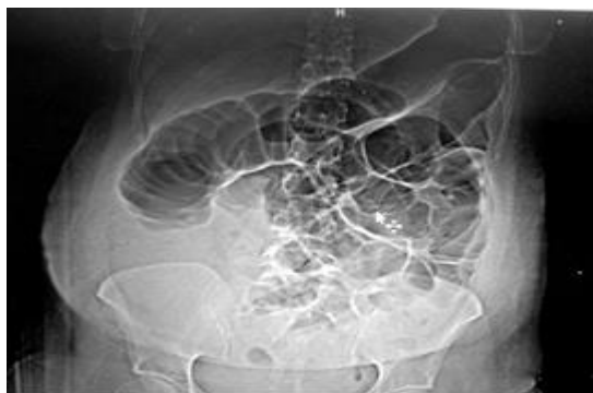
Figure 1. X-ray image of the patient's stomach indicating the severe dilatation of intestine and colon loops

After surgery patient was considered For 5 days in ICU and during this period, treated with broad spectrum antibiotics, optimal hydration and nutritional support for PPN. On the fifth day after surgery, the patient received a liquid diet and bowel movements were established. After 10 days of surgery, the patient was discharged. In three months follow-up after surgery, there was no specific complication.