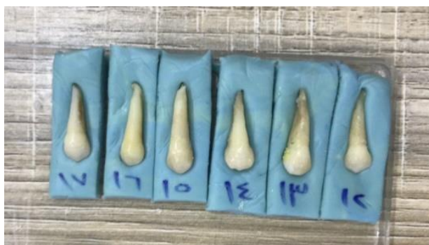
Figure 1. The samples on the modified slots to facilitate their manipulation

The research was submitted to the analysis of research Ethics and Scientific Committee at the collage of dentistry/university of Basrah and after approval, it was registered under the protocol of the collage research plan number BDC-7-049-22-3. Twenty-six previously extracted teeth were included in this experimental study. Each of the chosen teeth was sound, and teeth with caries, crack, or fracture were excluded. Each chosen tooth was autoclaved in distilled water and a glycerin solution (Equate, Wal-Mart Stores Inc. AK, USA). Throughout the course of the experiment, a moist piece of special cotton was used to rub each tooth that was kept in a particular compartment within a tube. Then, in order to speed up the process, these samples were put into a numbered slot made of silicone putty (Vonflex polyvinyl siloxane, Korea) (Figure 1).