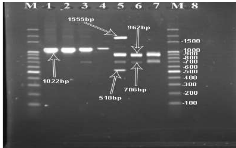
Figure 2. Electrophoresis result of successful reproduction of ccrA/B1 , ccrA/B2 , ccrA/B3 , ccrA/B4 and ccrA2/B genes, with amplicon length of 1022 bp for the ccrA/B1 gene, 962 bp for the ccrA/B2 , 706 bp for the ccrA/B3 gene and 1555 bp for the ccrA/B4 gene on the 2.5% agarose gel. Wells 1 to 6 positive samples in terms of the presence of genes, Well 7 positive control, Well 8 negative control. M Marker Lobe with a length of 100 bp. Staphylococcus aureus strain ATCC33591 was used as a standard strain of positive control and strain of Staphylococcus aureus ATCC25923 was used for negative control.