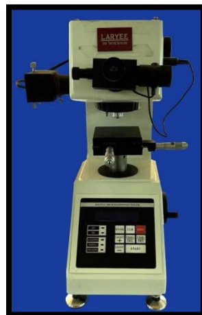
Figure 2. Vicker's hardness device for measuring the surface hardness

F is the loading force, and d is the mean of the indentation diameters. For each material, the mean and stranded deviation values of the specimens were calculated (22).